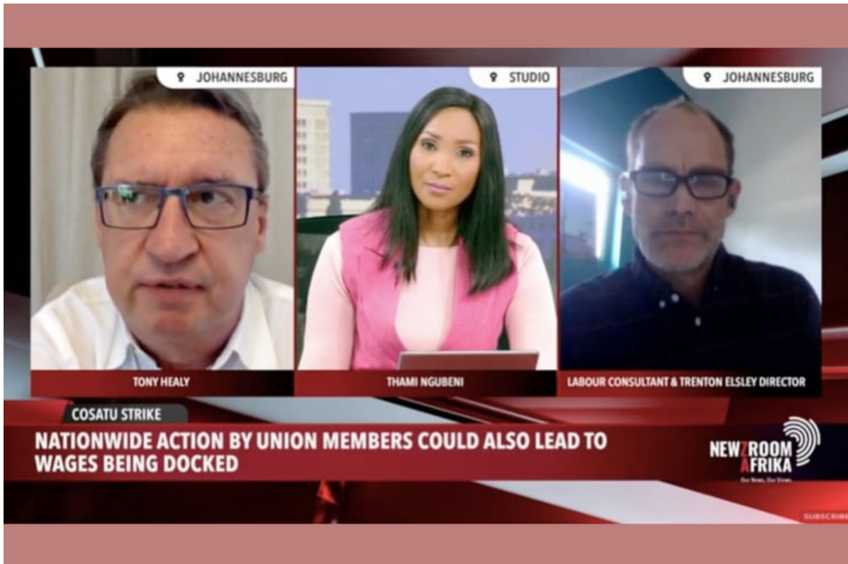
The Labour Research Service provided insights through various media outlets in 2020.