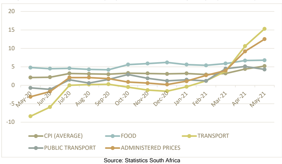
Figure 1: Consumer Price Index (CPI) and selected price categories | May 2020 to May 2021