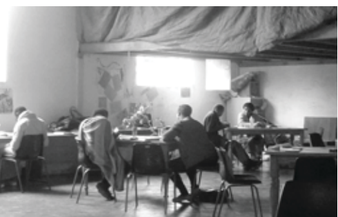
Letsema writing workshop, September 2015.