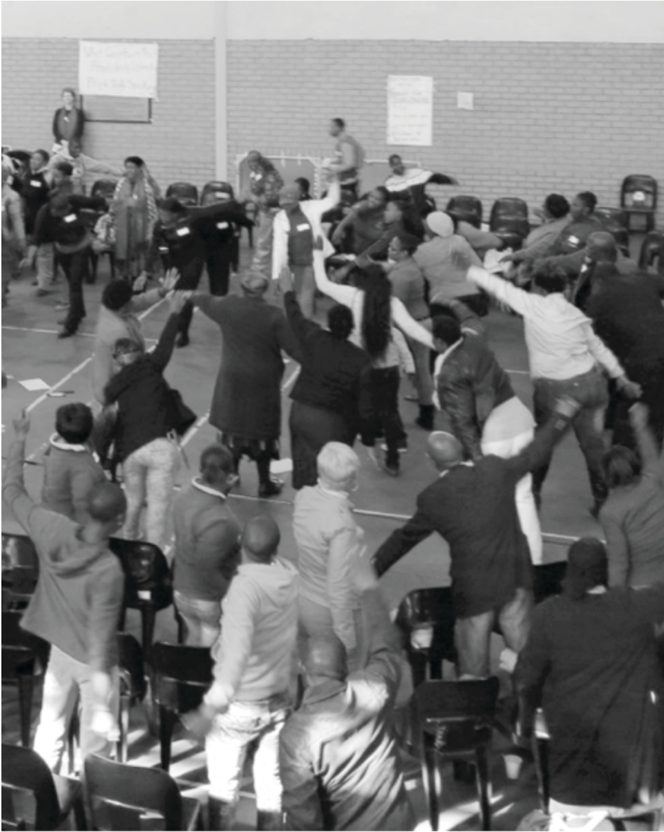
Letsema Open Space, Saul Tsoetsi Sports Centre, June 2014