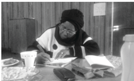
Letsema writing workshop, 2-4 September 2015.