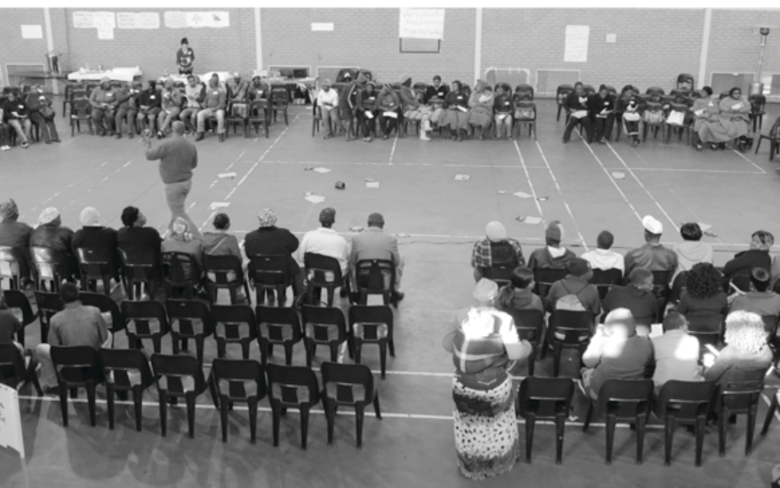
This page: Letsema Open Space, Saul Tsotetsi Sports Centre, June 2014. Opposite page: We started off each day of the writing workshop with Tai Chi, September 2015.