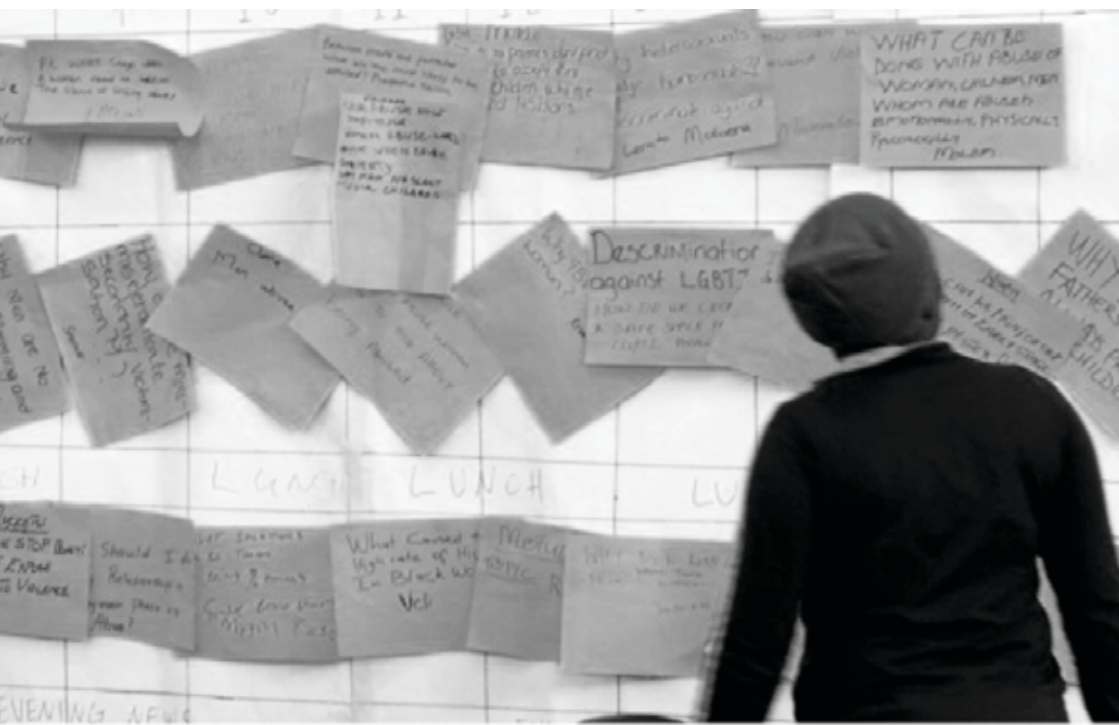
Letsema Open Space, June 2014.