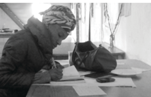
Letsema writing workshop, September 2015.