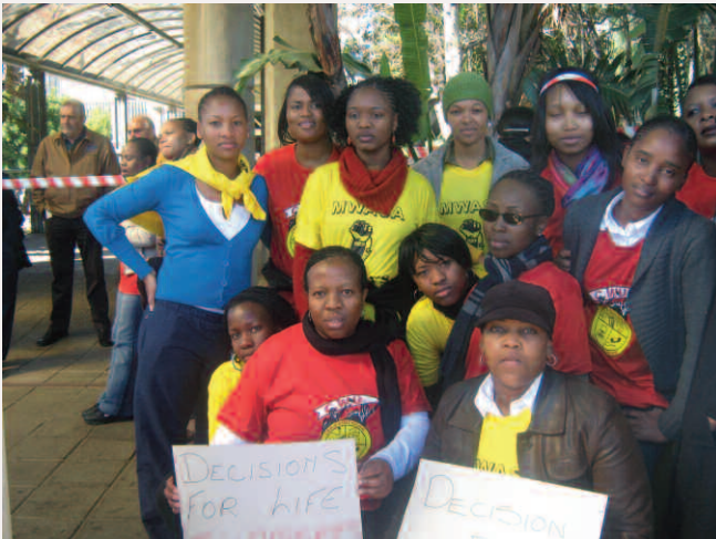
A Decisions for Life team supporting an SABC strike.

T he Labour Research Service (LRS) coordinates the campaign with all four national centres affiliated to the ITUC and three UNI affiliates. This coalition was later broadened as they formed networks with NGOs and cultural groups, extending the reach of the campaign.