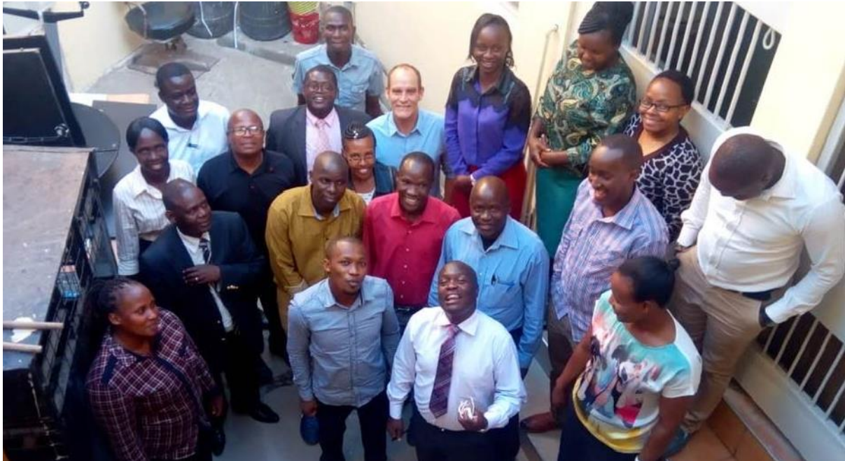
A workshop with Kenya Union of Commercial Food & Allied Workers, Nairobi, 2019